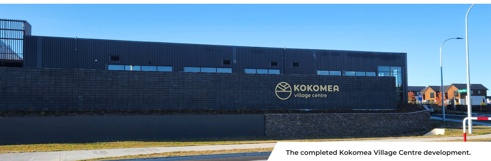
The completed Kokomea Village Centre development.