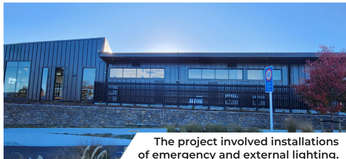
The project involved installations of emergency and external lighting.

“Off-Grid sit up there with the top electrical guys that I have worked with around the country”.